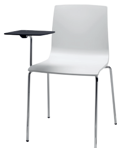
2678 TP II

Scocca in tecnopolimero riciclabile. Struttura in acciaio tubolare \varnothing mm 16 cromato con tavoletta scrittoio antipanico, movimento a ribalta. Impilabile. Per uso interno.